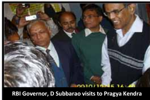
RBI Governor, D Subbarao visits to Pragma Kendra