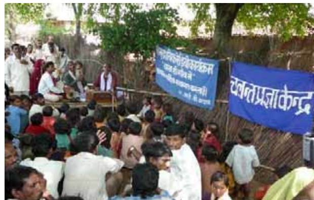
Citizens participate at the CSC awareness camp