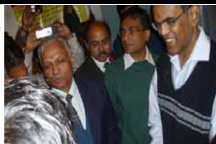
RBI Governor, D Subbarao & chief secretary of Jharkhand, A K Singh during the visit to Pragna Kendra

The Governor, accompanied by the Chief Secretary of Jharkhand, Sri AK Singh, ED of Bank of India, DCMD of SBI and various Bankers, visited Dobha village on Dec 15, 2010. After a series of functions, RBI announced that it had adopted Dobha village of Kuru block of Lohardaga district. Dobha is a small village of about 1500 households, mostly tribals (village profile attached). With no post office or banks, banking is a far cry. The Governor inaugurated the country's first satellite branch set up by Bank of India in the newly constructed panchayat bhawan of Tati panchayat. The satellite branch will operate once a week and will be connected to its home branch located in Kuru through V-sat.