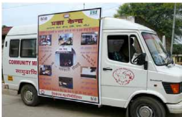
Awareness campaign around CSC through a mobile van

Assam: A two day training program was organized by SBI & M/s Zoom Developers, in Guwahati on Dec 23- 24 at the Institute of Rural Management, Beharbari. The first batch had around 38 selected VLEs from the districts of Kamrup, Nagaon, Morigaon & Karbi Anglong.