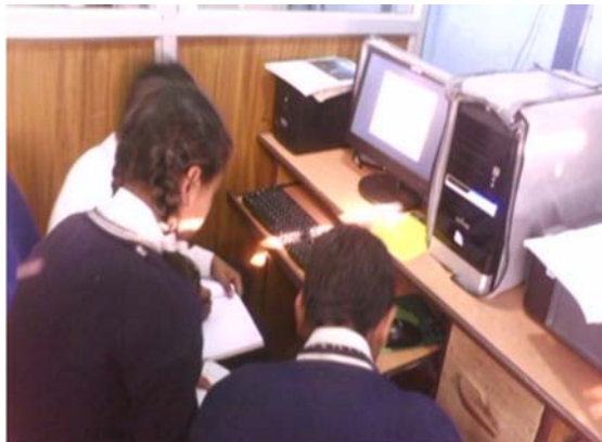
Pilot e-Literacy Project through CSC, Sikkim (Hee Yangthang CSC, West Sikkim)

are being offered through CSCs in NREGA Data Entry Job, Biometric Ration Card Preparation, computer training for Govt. School teachers.